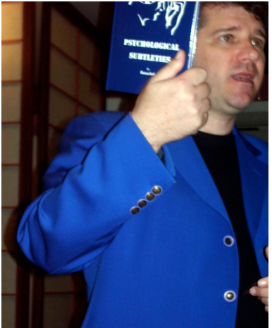
Not So Subtle . . .